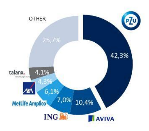
Diagram 2: Share of the largest non-life insurance companies in the market in Poland<sup>5</sup>