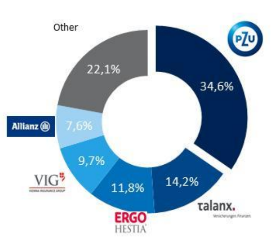
Diagram 1: Share of the largest non-life insurance companies in the market in Poland<sup>4</sup>

Due to the increase in tariffs and restructuring of the quality of the motor insurance portfolio (specifically in the corporate client segment), PZU maintained very good technical results compared with other companies on the market. This was especially noticeable in motor third-party liability insurance.